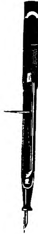
Sectional View No. 2